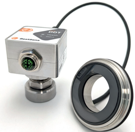
Sensorized counter ring and sealDOT